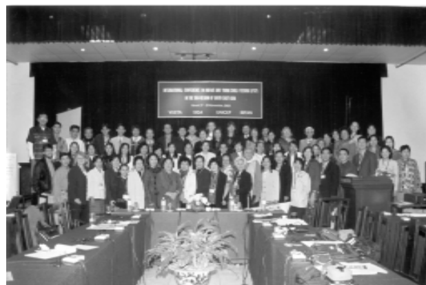
Participants at the International Conference on Infant and Young Child Feeding at Hanoi, Vietnam