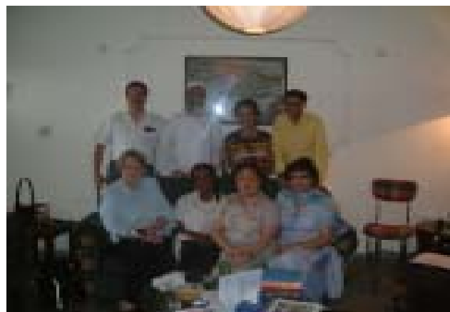
Participants at the Review and Planning meeting of IBFAN Asia Pacific and IBFAN South Asia